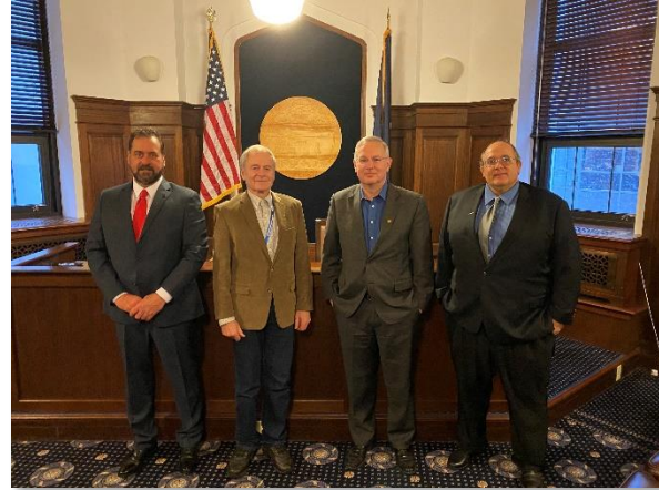
Meeting with constituents from back home remains the best part of the job